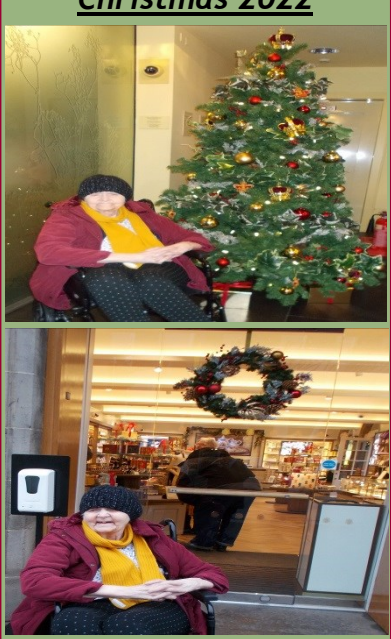
A Royal Festive Christmas tree greeted us at the Queens Gallery and a trip to the gift shop to buy a souvenir of the trip