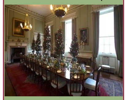
Dining room at Holyrood Palace. Traditionally individuals had their own Christmas tree where the presents were placed to open on Christmas Eve. The cutlery on display is the actual cutlery used by the Royal Family when they visit