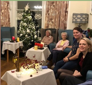
Candlelight Service with family and friends