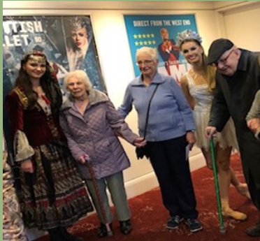
Visit to the Festival Theatre and the Snow Queen